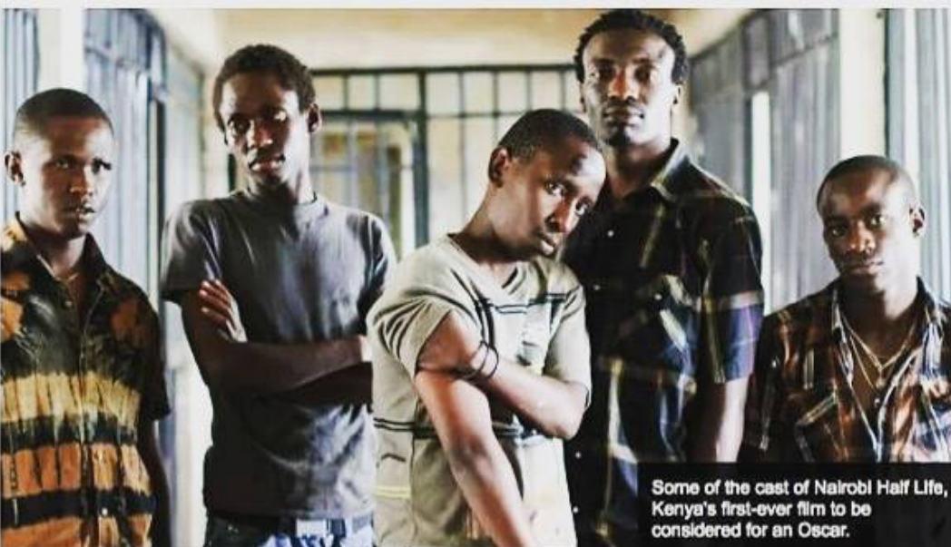
Some of the cast of Nairobi Half Life, Kenya's first-ever film to be considered for an Oscar.