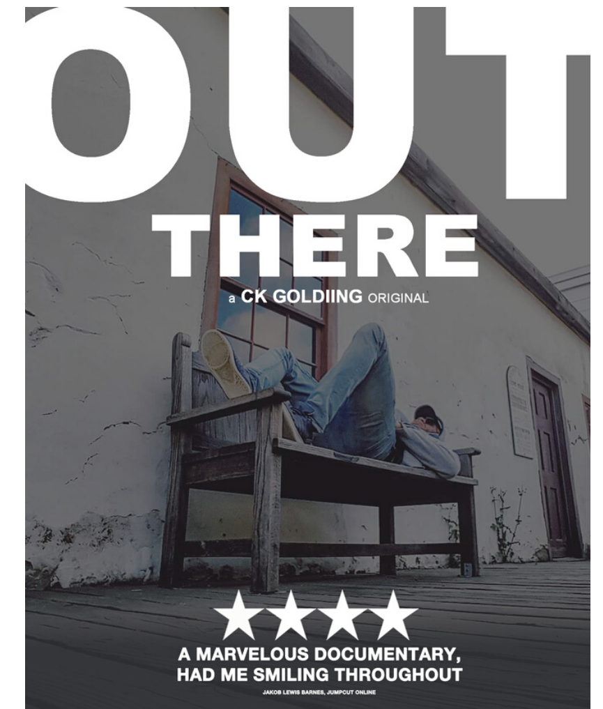
'OUT THERE' SHORT DOCUMENTARY CLICK TO WATCH