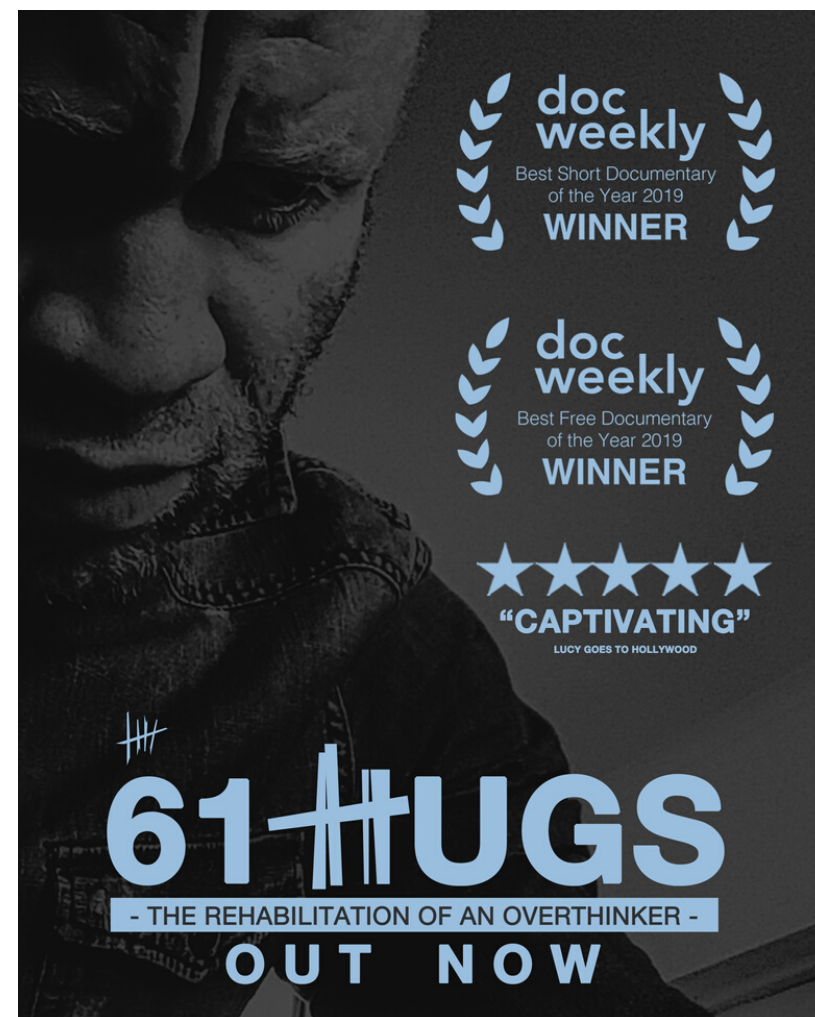
'61 HUGS' AWARD-WINNING SHORT FILM CLICK TO WATCH