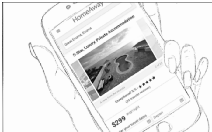
VO: HomeAway has over one million instantly bookable properties, so it's easy to find the perfect vacation rental. PHONE SCREEN: We see HomeAway.com or the HomeAway mobile app.