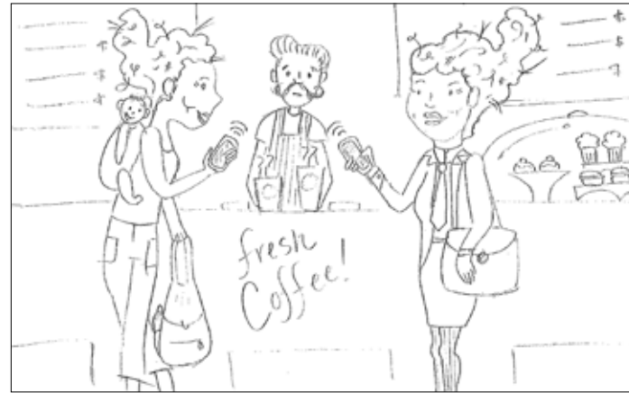
Wider shot: We see two Busy Moms with distinctive hairdos standing together at the counter talking excitedly. Office Mom (40s) is dressed in formal office attire. Backpack Mom (40s) has the Child in a large child carrier on her back. Office Mom is showing Backpack Mom her mobile phone. A Barista works in the background preparing their drinks. OFFICE MOM: Busy, busy mom, busy mom? IMAGE: An amazing HomeAway property housed in a Facebook post pops up. JEN: Let's book a HomeAway for the weekend! Backpack Mom deftly flicks a cheerio off her shoulder as she shakes her head no. BACKPACK MOM: Busy mom.