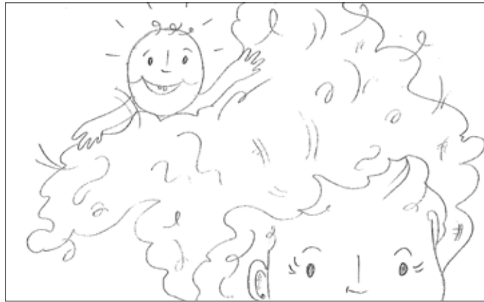
A coffee shop interior. CLOSE ON: A Busy Mom hairdo dominates the screen, as a Child (age 3) struggles to see over the top of it, finally pushing apart her hair down the middle to see through. BACKPACK MOM (O.C.) as the child cranes around her hair: Busy, busy mom, busy mom.