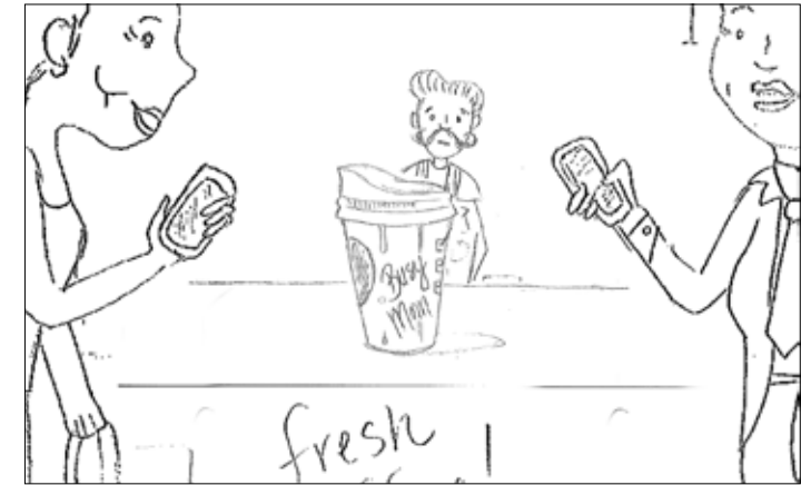
Office Mom begins to type on her mobile phone, just as the barista pushes a coffee cup towards screen with the handwritten name on "Busy Mom". BARISTA: Double espresso for Busy Mom? Both moms reach for the cup at the same time. Scene freezes as VO comes in. VO: Being busy shouldn't keep you from reconnecting.