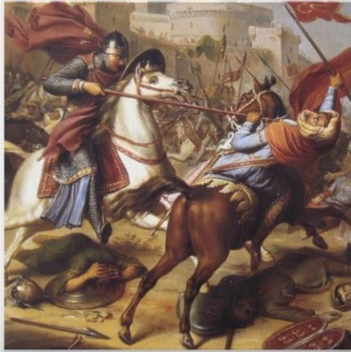
King Arthur in Battle.

Translation phrases & pages – From Irish/Gaelic to English, Portraits, Pictures