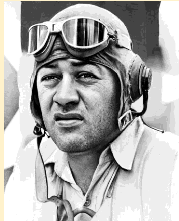
Major Greg "Pappy" Boyington